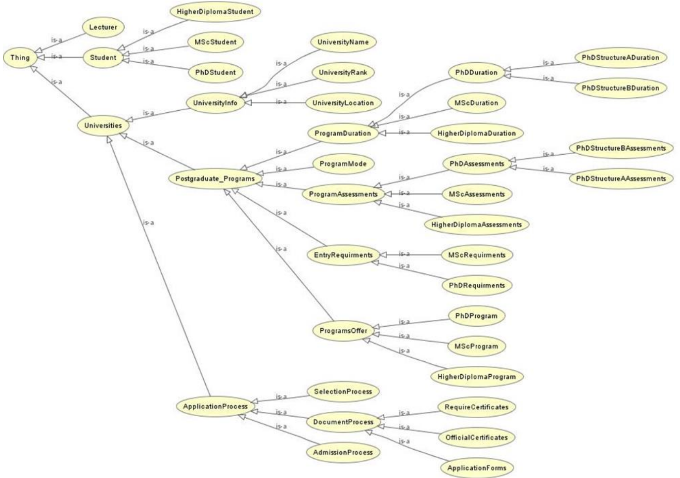
Figure 3: The ontology for Postgraduate Query System visualized in OWLVIZ